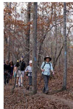
Helen Hall out front