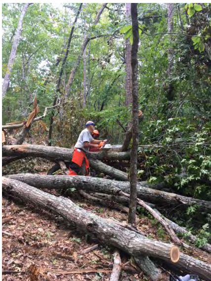
LEFT: Mark Hughes cutting on Delano Trail on that "finale" Mike spoke of and RIGHT is what Mike found at the Beaver Pond/ PMT intersection and cleared by himself! Notice the sign was NOT hurt.

On Monday, September 11, 2017 Tropical Storm Irma paid an unwelcome visit to the Pine Mountain Trail. The result was nearly 60 downed trees blocking not only the PMT but every side trail as well. Within four days of Irma's passage a small group of volunteers had already checked over 38 miles of the trails for downed trees. By Friday evening the Wolf Den Loop was opened back up after another small group of volunteers cleared all the downed trees. A called work day on Saturday, September 16 th brought 15 volunteers together to clear another 8 miles of trails in one section and 2.1 in another. Over the next six days several more downed trees were cleared by individuals and small groups. A final called work day on Saturday, September 23 rd brought 10 more volunteers together to clear the remaining downed trees, including a HUGE finale on the Delano Trail. I would like to say a big thank you to everyone who helped with this clean-up project. Thanks to your efforts 42 miles of trails and 16 backcountry campsites were checked and cleared within 12 days! That is an impressive accomplishment for an all- volunteer organization. It is efforts like this that make me proud to say the Pine Mountain Trail is the best maintained trail in the State of Georgia. Mike Riffle