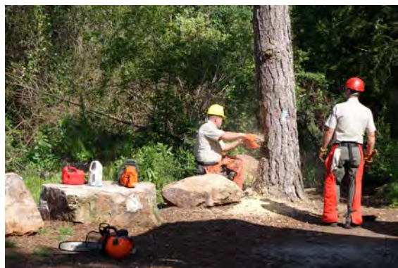
Many of the dead trees near Neal's Rest/Mile 23 Trailhead were cut down in early July with JB and Steve of the FDR Maintenance staff working with us. They also had help cut 6 large dead pines at Bumble Bee Ridge Campsite.