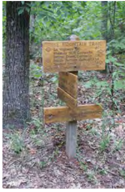
Jonathan Hall over a 5 month period sanded nearly ALL the wooden signs along the trails (they were recoated with deck seal too.) They look like new!