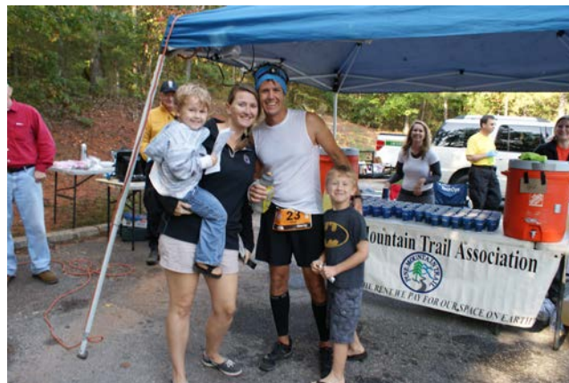
A 50 mile runner is greeted by his family at Rocky Point