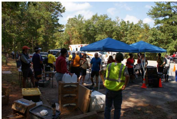
Busy time at Rocky Point Aid Station