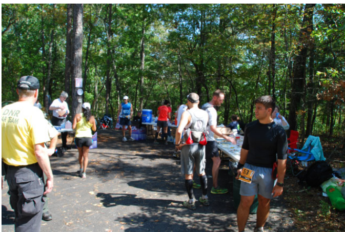
BooTop Trail Parking Area Aid Station