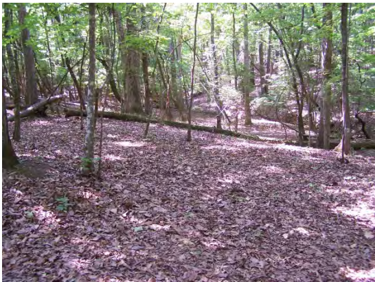
Tent sites area is rather large flat area along the spring.