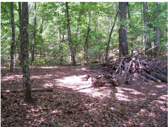
Fire ring at Turtle Hollow.....