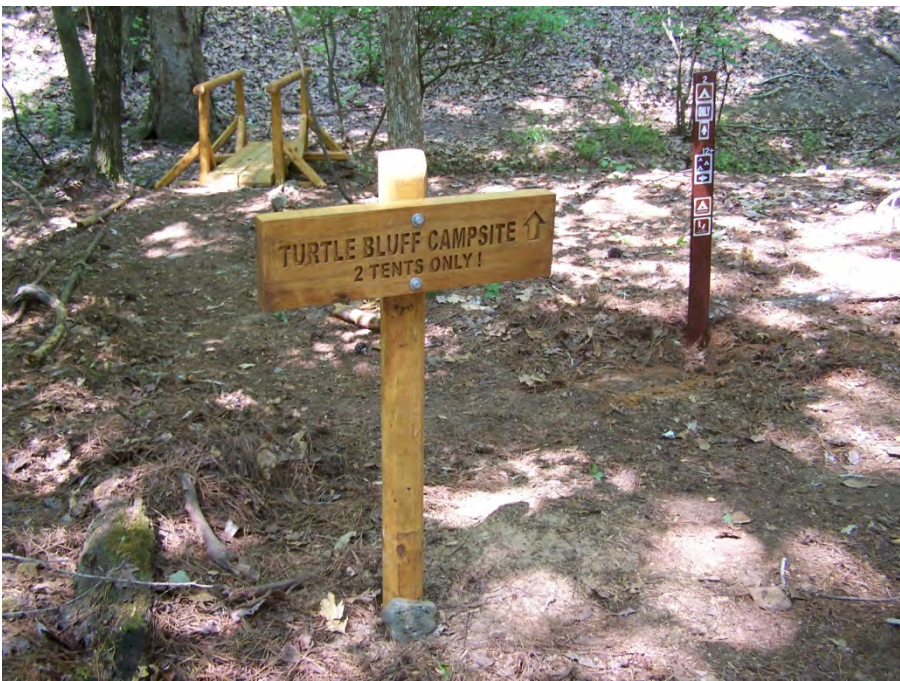
As noted, 780' off the Pine Mountain Trail you come to this area. Straight ahead across the bridge is a short path to Turtle Bluff. To the right leads you to the main Turtle Hollow Campsite area.