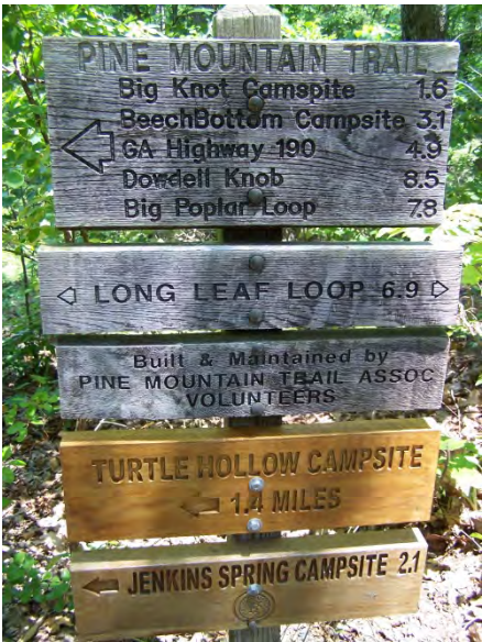
Direction sign at Fox Den Cove Parking Lot