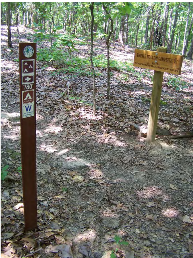
Signs at the start of the access trail to the campsite