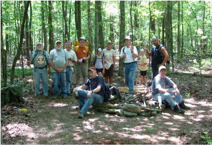
Some of the volunteers who helped clear the trail and campsite