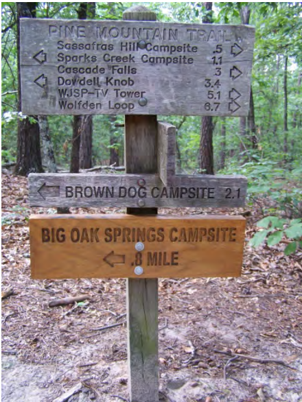
Direction sign near Rocky Point