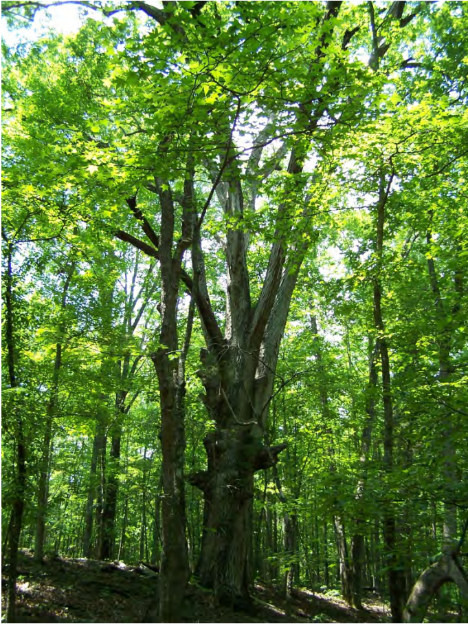
The BIG OAK