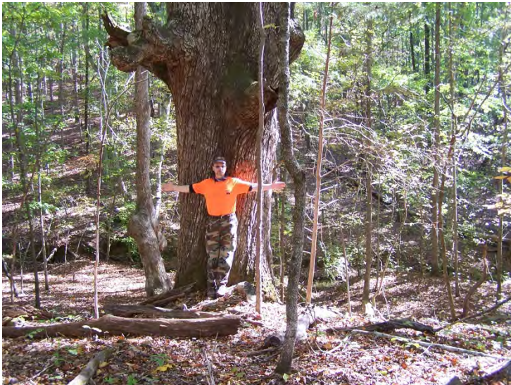
Eddie Hall with the BIG OAK