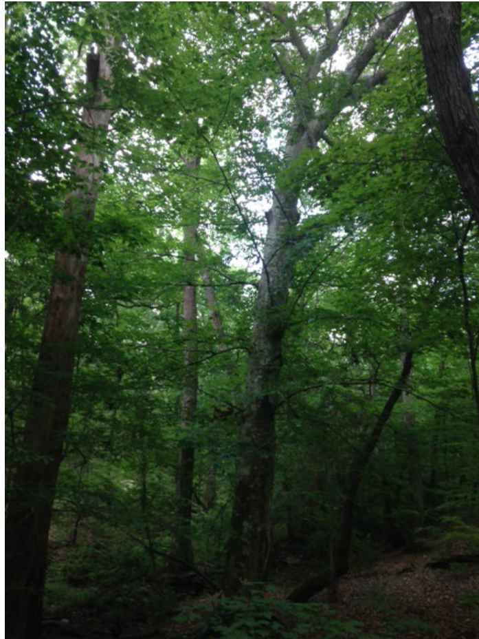
Large beech trees all in the campsite.