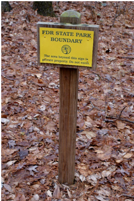
Main park boundary sign about 250' from fire ring to the north.