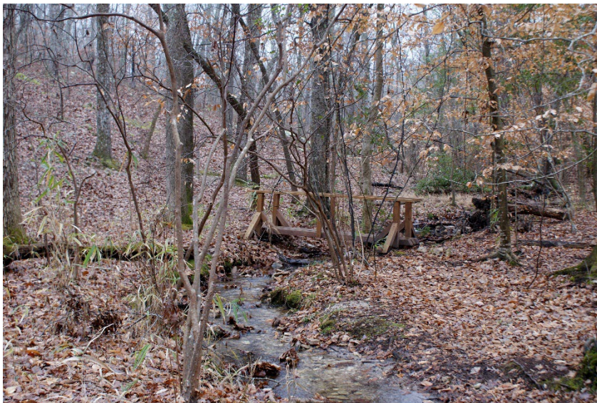
Bridge just off the Pine Mountain Trail leading to campsite. Trail is seen just beyond the bridge.