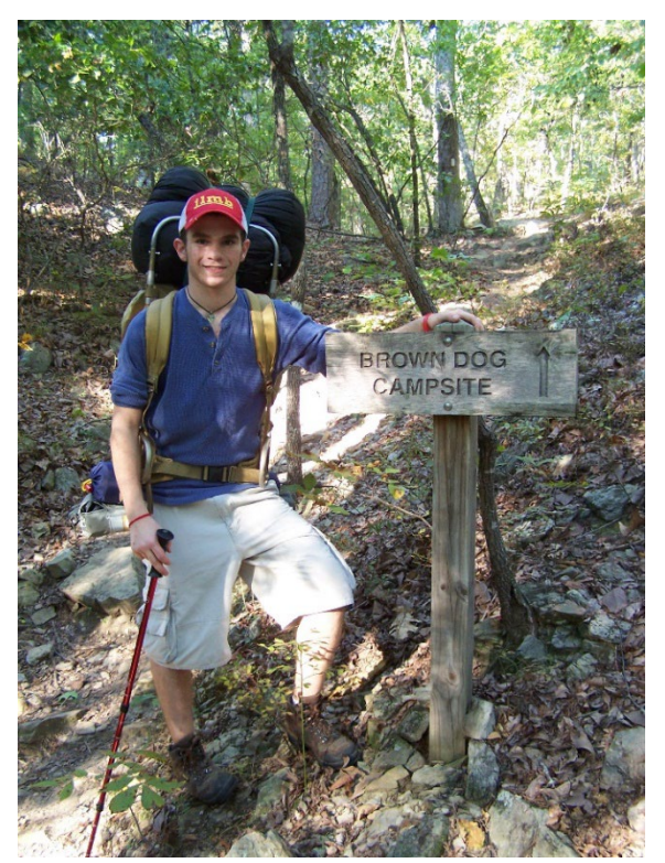
With new sign he helped install in 2017 before site was moved in 2023