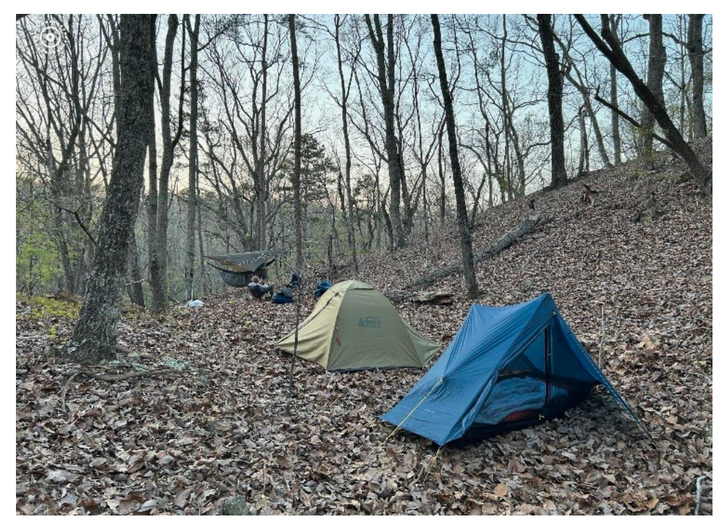
First campers used the new/relocated camp on 3/24/2023

This is the water source near Brown Dog Bluff....265' west of Brown Dog Campsite entrance signs. Water flows here all year, even in driest months. NOTE: The water may have a slight "tea" color, this is from decaying leaves and water it still good. Like all water along the trails, it must be boiled, treated or filtered for safety.