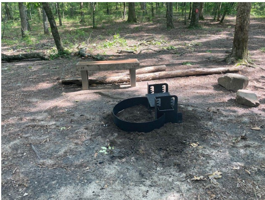
Right west of the entrance to Old Sawmill Campsite is FERNEY the BIG pine tree, 14.5' around at 4' off the ground Is said to be about 250 years old.