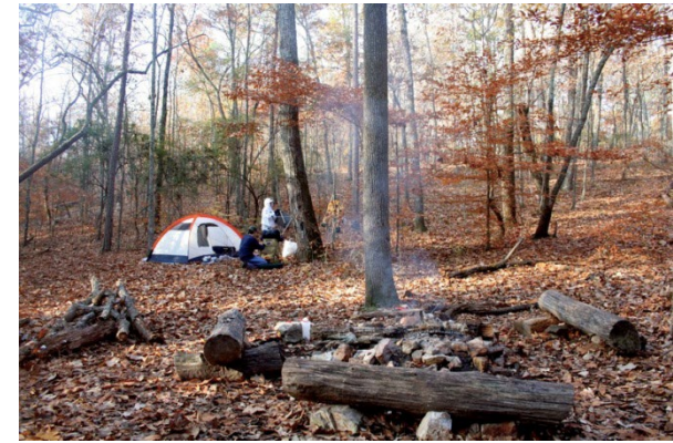
Beech Bottom Campsite in winter (November)